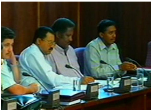
“My focus has always been on the people”