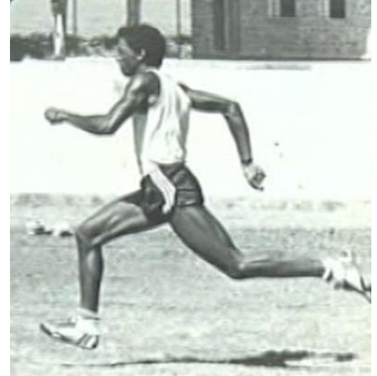
A young Danny Faure in action

Every morning, President Faure would clean the house, which included brushing the floor with bros koko before going to school. Consistently driven by the goal of “serving the people”, as a boy President Faure dreamed of becoming a priest and serving his community, before choosing to start a foundation year in teaching. During this time, President Faure was also very active in church and training every day in the National Athletics team. It was catching President Albert Rene on the radio one day that changed everything. “He was speaking about action-oriented social justice, and it echoed my own values completely,” says President Faure.