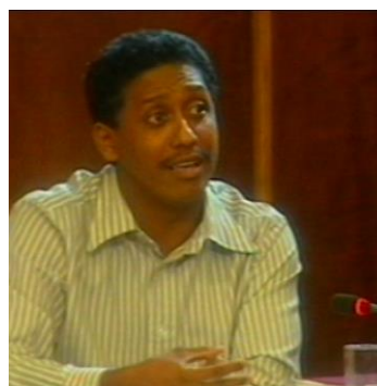
LGB in the National Assembly in 1993